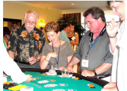
Education A Sure Bet