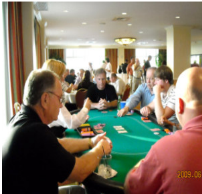
Monte Carlo Night

Everyone that attended the Monte Carlo Casino night had a great time. It was a fun way to raise money for our scholarship fund.