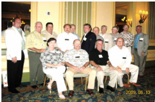
SEMA Board of Directors 2009-2010