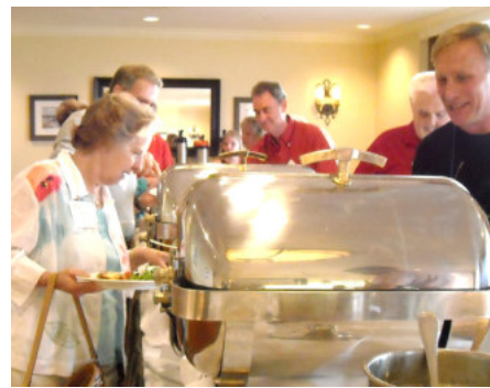
SEMA Convention Networking, Partnering, Building Relationships and Fun