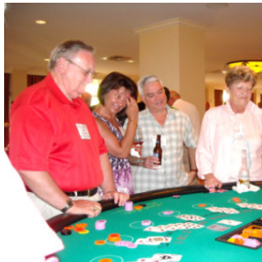
Fun for All