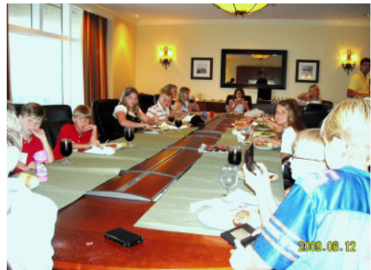
Future SEMA Board of Directors